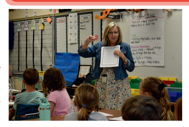
Highly effective teachers help students go from "struggling" to "striving."

Mrs. Tegan explains, "At Camp iRock, we are dedicated to giving our students a successful learning environment where 'struggling' becomes 'striving.' The true measure of success is the expression on a child's face during our celebration ceremony when they are adorned with a super hero cape and mask. At that very moment, THEY are a SUPER READER HERO!"