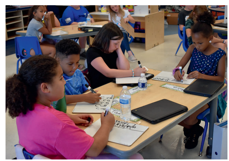
No tours this year, but the Camp iRock teachers shared student success stories.

All during Camp iRock, they send me success stories to share with you. This is one of my favorites.