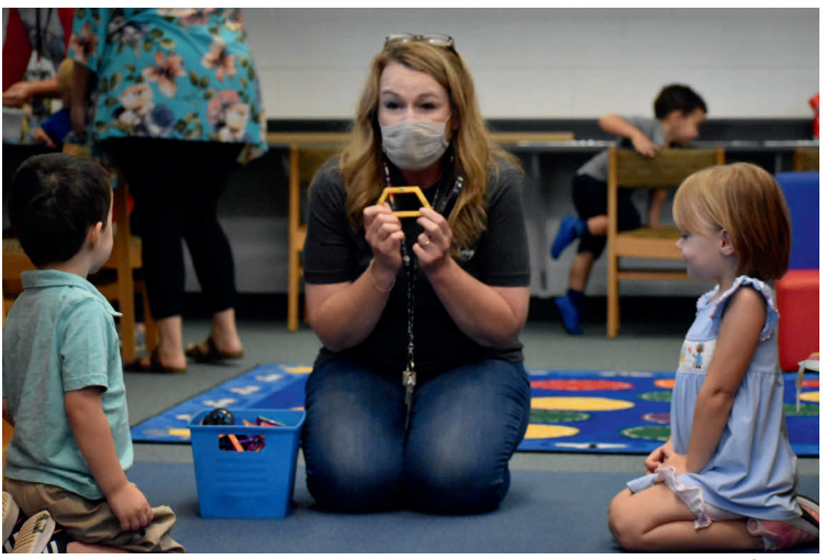
► Hands-on activities bring stories—and learning to life.