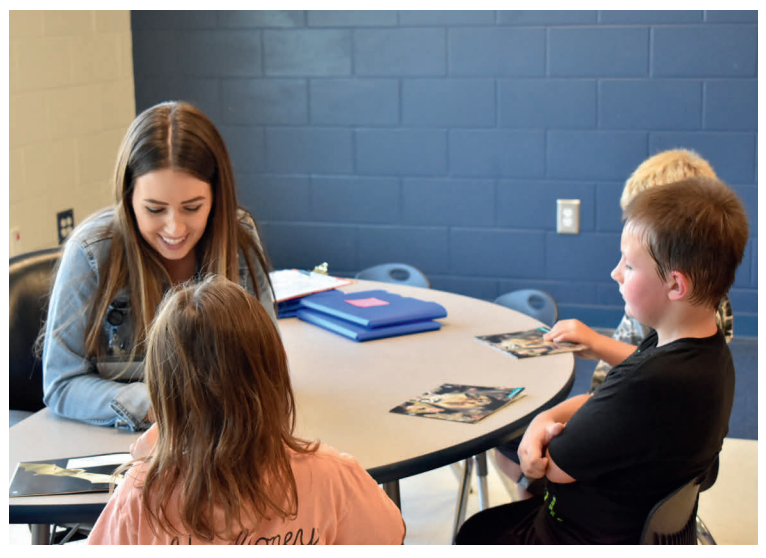
Small group instruction is a cornerstone of Camp iRock.

Children who struggle with reading do NOT feel successful. If not addressed, these feelings of failure follow them throughout their lives.