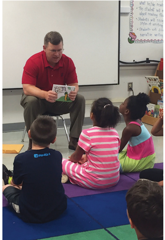
Kindergartners loved when volunteers read to them.

The teachers reported that the kindergarten students handled Camp iRock very well. They urged us to expand K5 to the full 8 week program.